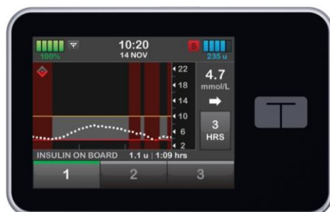
Illustration of Insulin Suspension Display on Pump

In the illustration above, it can be seen that at 1830hrs, the algorithm has detected that the glucose value will be <4.4mmol/l at 1900hrs. Basal insulin delivery is stopped thereby preventing a hypoglycaemic event. Insulin delivery is automatically resumed when the sensor value increases by one point.